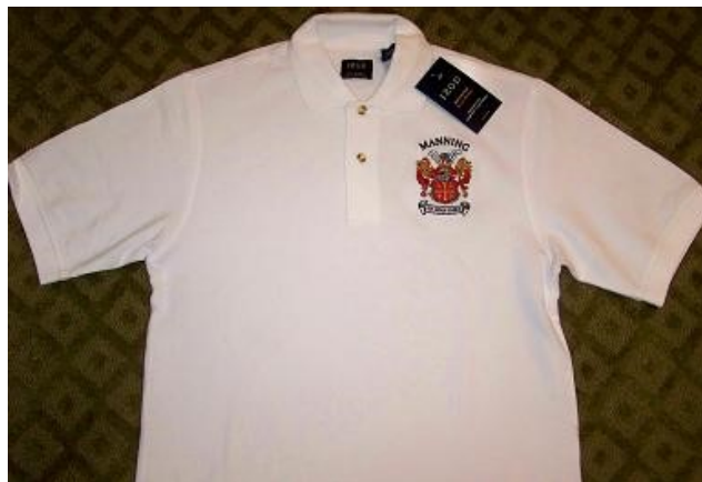
Polo Shirt (S, M, L) - $39.99

Be sure to specify item(s) desired and your name and address! OR, for a new option, go to our website to order.