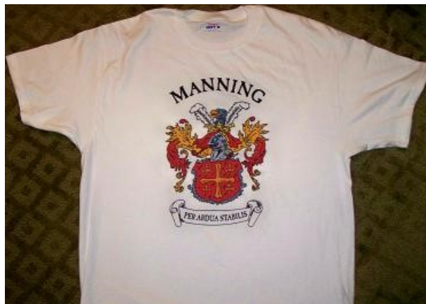
T Shirt (S, M, L) - $15.00